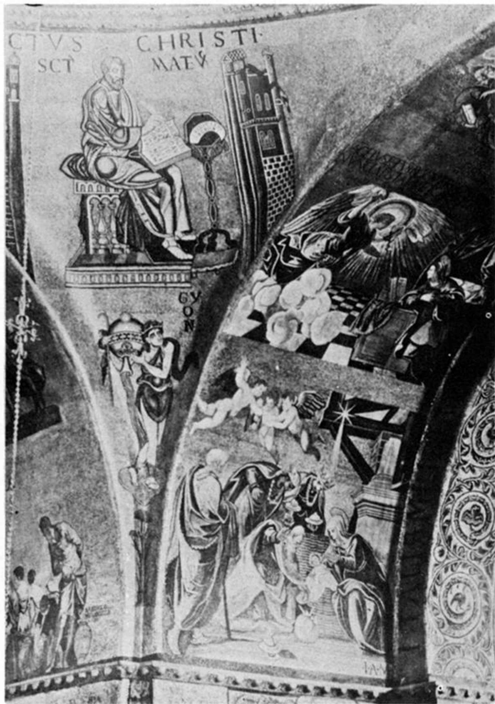
FIGURE 1. One of the four spandrels of St Mark's; seated evangelist above, personification of river below.