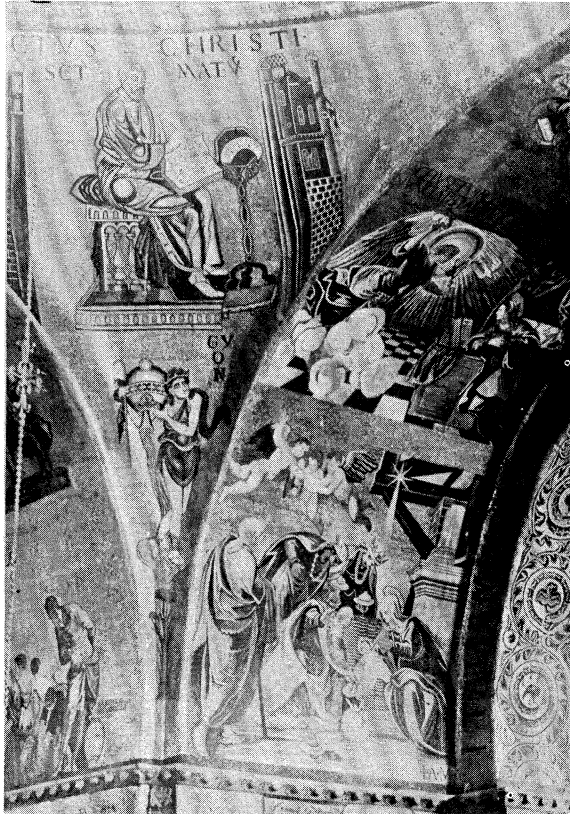
FIGURE 1. One of the four spandrels of St Mark's; seated evangelist above, personification of river below.

The design is so elaborate, harmonious and purposeful that we are tempted to view it as the starting point of any analysis, as the cause in some sense of the surrounding architecture. But this would invert the proper path of analysis. The