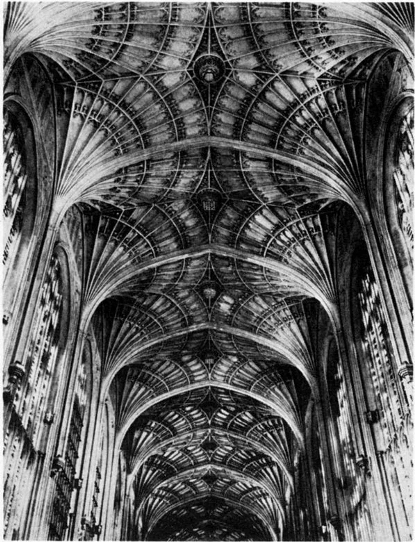
FIGURE 2. The ceiling of King's College Chapel.