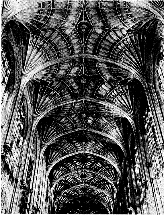
FIGURE 2. The ceiling of King's College Chapel.

the Tudor rose and portcullis. In a sense, this design represents an 'adaptation', but the architectural constraint is clearly primary. The spaces arise as a necessary by-product of fan vaulting; their appropriate use is a secondary effect. Anyone who tried to argue that the structure exists because the alternation of rose and portcullis makes so much sense in a Tudor chapel would be inviting the same ridicule that Voltaire heaped on Dr Pangloss: 'Things cannot be other than they