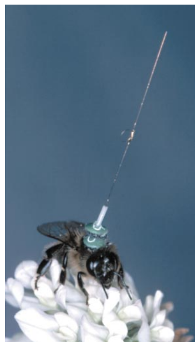
Figure 1 Bee wearing transponder used for harmonic radar tracking of flight. The transponder weighs less than an average load of nectar or pollen.

Cognitive ethology focuses on the study of animals under natural conditions to reveal ecologically adapted modes of learning. But biologists can more easily study what an animal learns than how it learns. For example, honeybees take repeated 'orientation' flights before becoming foragers at about three weeks of age 1 . These flights are a prerequisite for successful homing. 2 Little is known 2,3 about these flights because orienting bees rapidly fly out of the range of human observation. Using harmonic radar, we show for the first time a striking ontogeny to honeybee orientation flights. With increased experience, bees hold trip duration constant but fly faster, so later trips cover a larger area than earlier trips. In addition, each flight is typically restricted to a narrow sector around the hive. Orientation flights provide honeybees with repeated opportunities to view the hive and landscape features from different viewpoints, suggesting that bees learn the local landscape in a progressive fashion. We also show that these changes in orientation flight are related to the number of previous flights taken instead of chronological age, suggesting a learning process adapted to changes in weather conditions, flower availability and the needs of bee colonies.